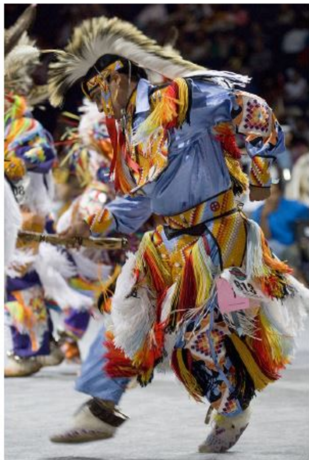
Example of Youth Powwow Dance

Powwows are based on fundamental values common to the Native American culture: honor, respect, tradition, and generosity. Cultural legends and stories are preserved throughout the generations, as they are passed along through song, music, and dance through their repeated performance at traditional powwows.