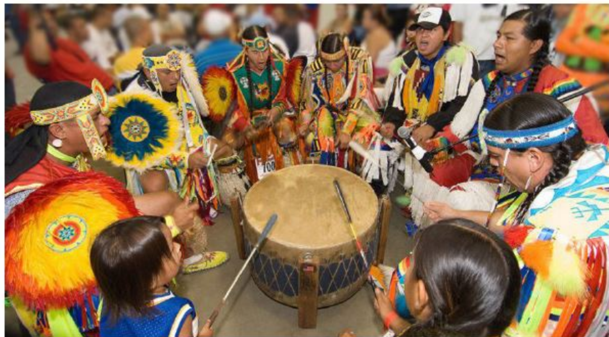
Example of Native American drums