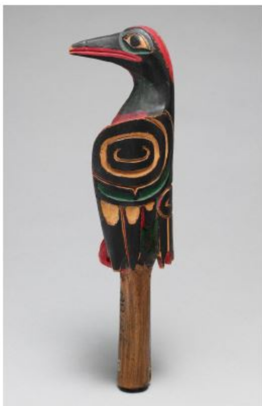
Rattle | Heilbrunn Timeline of Art History