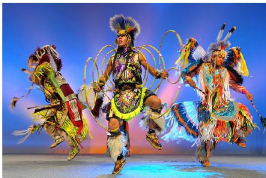
Example of Native American Dance

Native American dancing is typically done in an area that has enough space for more than one dancer. A circle is the most common way to see dancers perform. The movements of the dance illustrate the purpose of the dance. Sometimes a leader for the dance is chosen and the additional dancers follow them around the circle. Typically, individual drum families provide the music for the dancing.